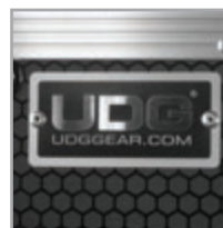
High grade aluminium UDG logo plate