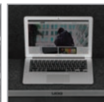
An extra notebook shelf included for your notebook