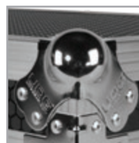
Secure stacking due to stackable ball corners