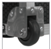
Built-in corner wheels with high quality in-line skate bearings