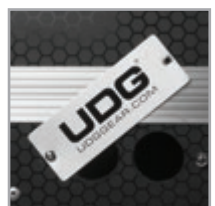
Cable access hole with removable UDG emblem cover