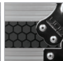
Improved powder coated and anodized hardware