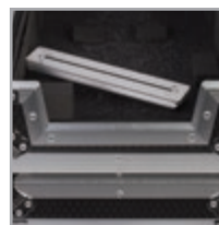
Removable front access panel