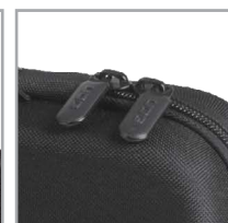
Easy grip zipper pulls