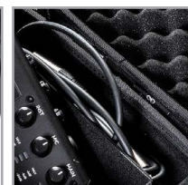
Extra cables space