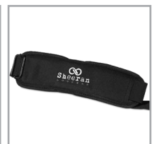
Convenient shoulder strap