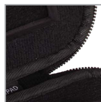
Durashock molded EVA foam