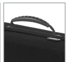
Heavy duty handle