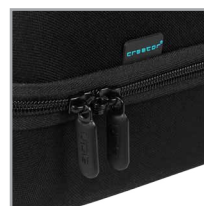
Easy grip zipper pulls