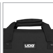
Convenient carry handles