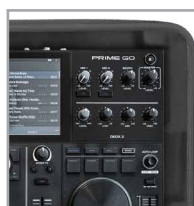
Skilfully moulded to fit Denon DJ Prime Go/ Akai MPC Live II