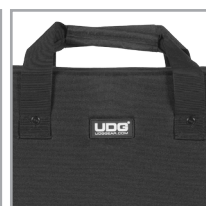
Convenient carry handles