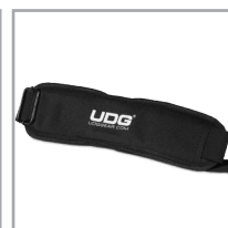
Convenient shoulder strap