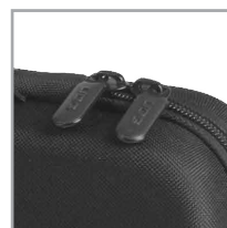
Easy grip zipper pulls