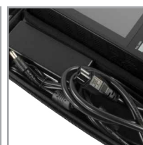
Extra space for power adapter & extra cables