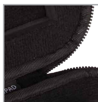
Durashock molded EVA foam