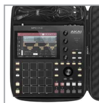
Skilfully moulded to fit Akai MPC One