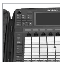
Skilfully moulded to fit the Akai Force