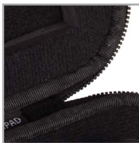
Durashock molded EVA foam