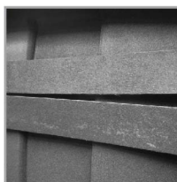
Includes adjustable foam pads