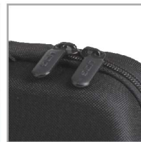
Easy grip zipper pulls