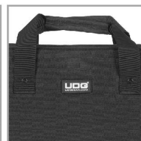
Convenient carry handles