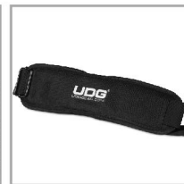
Convenient shoulder strap